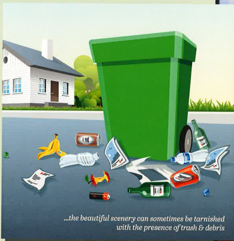
...the beautiful scenery can sometimes be tarnished with the presence of trash & debris