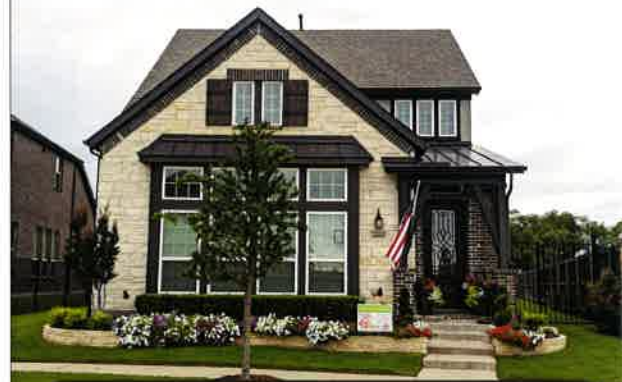
6800 ROYAL LIVERPOOL

CONGRATULATIONS TO OUR YARD OF THE MONTH WINNERS WHO EACH RECEIVED A $25 GIFT CARD TO CALLOWAY'S NURSERY.