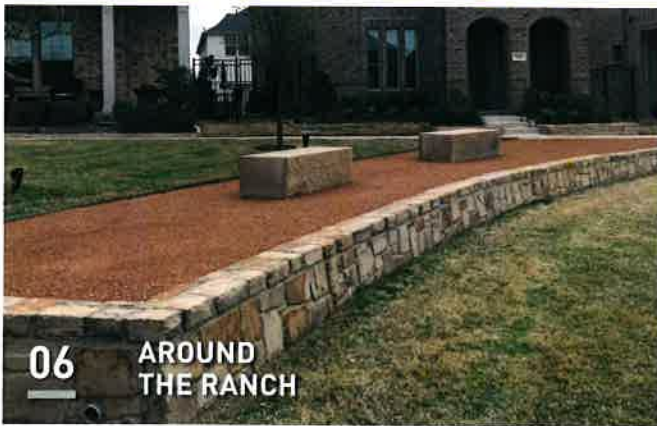
06 AROUND THE RANCH