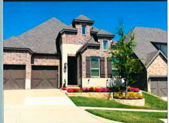
7004 HOMESTEAD DR

CONGRATULATIONS TO OUR YARD OF THE MONTH WINNERS WHO EACH RECEIVED A $25 GIFT CARD TO CALLOWAY'S NURSERY.