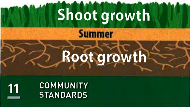
11 COMMUNITY STANDARDS