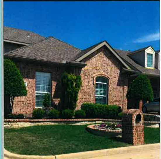
8704 LA QUINTA